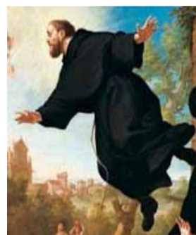
St. Cupertino Demonstrates FundRAISing

No one was ever hurt by setting bold goals. Proceeding without evidence sometimes works; neither Galileo nor Kepler ever visited any of the planets whose orbits they predicted. Joining these forward-looking stargazers is the LSU Foundation, which has unveiled a boldly spare strategic plan comprised of four principles—“invest in people”; “redesign organization and operations”; “strengthen cross-campus collaboration”; and “execute large-scale fundraising efforts”—and including a fundraising target double the present rate. No details have been provided as to how this will happen, but, then, no one was asking for the fine points when St. Joseph Cupertino levitated in the cloister!