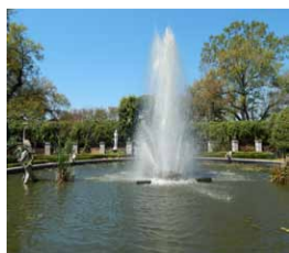
Houmas House Courtyard Fountain

Although it is no match for Rome, Florence, or other fountain-rich cities, Baton Rouge offers more than a few remarkable water spouts. Baton Rouge designers have enthusiastically explored the conundrums inherent in what landscape builders now call the "water feature." Sharing with the other members of the human species the ancient attraction of all creatures to clear, active, and refreshing water sources, the denizens of south Louisiana have deployed an array of publicly accessible fountains that delight visitors while exploring the potential of a genre whose study is never dry.