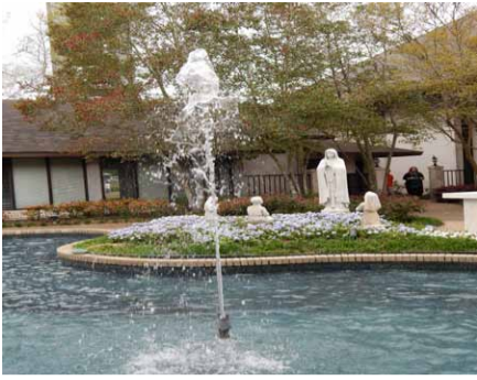
Our Lady of Mercy sculptures

Somewhat more successful, in the way of ad hoc abstract iconography, is the little pool and alcove in the LSU quadrangle, which, over the years, has hosted an assortment of water-venting figures. A welcome break from the symmetry of the quadrangle, this fountain makes the simplest of nods to the peculiar, slightly bumbling mixture of Baroque and Greek Revival idioms that has created the architectural hodgepodge of Louisiana. A soaring success in this genre, on the other hand, is the beautiful reflecting “pool of prayer” lovingly situated between the church and the adoration chapel at Our Lady of Mercy. There, unexpected recapitulations of the holy trinity arise from three strong but discrete vertical jets that image hope and heavenward aspirations. A grouping of the Virgin Mary with the Fatima apparition children reinterprets the triune thinking of Christianity in ways that are simultaneously traditional and gender- and role-redefining. The