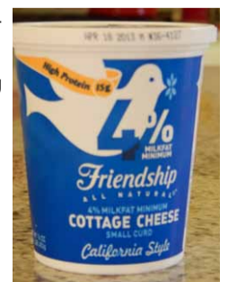
Friendship Cottage Cheese

For years, the culinary bureau of the Newsletter has scanned the grocery world in search of the perfect cottage cheese. As the semi-adjectival word "cottage" suggests, the best rendering of this post-milk genre should suggest the freshness of the farmstead or the wind on the heath. Unfortunately, all too many commercial cottage cheeses suffer from adulteration. Guar and carrageenan gums exaggerate the stickiness or elasticity of the curds; ascorbic or other acids exaggerate the yogurt-like tartness of this subtle delicacy; excess processing exaggerates curd size; lust for creaminess leads to indefinite texture. At long last, that simulated village square, The Fresh Market, has offered up Friendship brand cottage cheese, which attains the perfect consistency, perfect curd size, and perfect acidity without the addition of artificial texture regulators or any non-dairy ingredients. Indeed, it could be argued that, in using "naturally sourced" carbon dioxide as a preservative and thereby fixing it in a non-gaseous form, Friendship cottage cheese is successfully battling global warming. Be sure to select the whole-milk "California style" (but made in New York) cottage cheese for the ultimate cottage cheese experience!