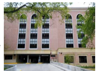
New Parking Garage, Raphael Semmes Road Entrance

LSU’s perpetually delayed parking garage—compare its construction to the hypersonic speed at which a similar structure at McNeese State University is coming together—finally opened on March 1st, welcoming transient parkers to a multi-deck parking extravaganza at bargain-basement rates of $1.50 per hour. Rumors of a ribbon cutting abounded in the weeks following the unveiling, culminating in an official opening ceremony April 5th.