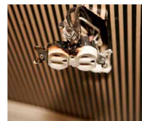
LSUE--Extra Money but Inadequate Juice

including a severe shortage of electrical outlets at student desks and work stations. Well, at least students won't be spending classroom time reading the online, electrically dependent Newsletter!