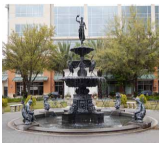
Perkins Rowe Fountain

Far more successful among the traditional, representative fountains is the two-installation array at perpetually bankrupt Perkins Rowe. There, in a piazza that is probably the only successful evocation of a city square in this otherwise excruciatingly cramped development, rises a jovial ensemble of sea sprites, fish, wading birds, and water bearers, all of them whimsically spraying in this or that direction but without overcrowding the scene with too many misdirected jets. The iconography of this fountain is a bit confused,—the identity of the female figure atop the fountain is vague and her water-dispenser looks somewhat like the oil can of the Tin Man in The Wizard of Oz —yet the