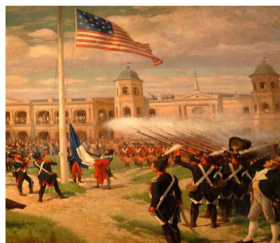
For-Profit Credit--Not the First Time Transfers have Cost Monarchs National Office