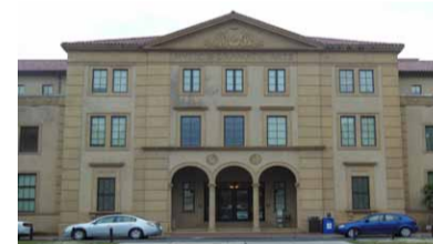
Music and Dramatic Arts Building