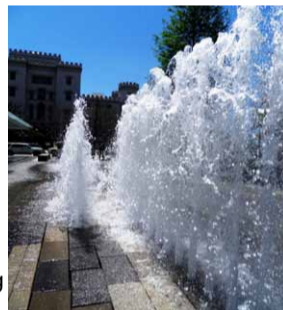
Manship Center Fountain

Nostalgia to the point of kitsch is endemic to some fountains. Admittedly, designers often have few choices. As was noted in the recent February issue of the Newsletter , the clumsy rendering of Christopher Columbus that seems to be running from the casino and heading for the ticket window at the River Center (while balancing a sextant more in the manner of a trained seal than of an accomplished mariner) recalls a vast worldwide inventory of monuments that celebrate the wrong person in the wrong way in the wrong place. Funded by the Italian American society in an attempt to claim the Spain-funded sailor for their own, the Columbus memorial is, in fact, a fountain, and a fountain that raises questions. Two of those questions include, "why is Columbus, who could sail a perfectly watertight boat, wading in a little pool of minimally moving water?" and "why is Columbus, who made his name exploring Poseidon's realms, walking away from, rather than toward, a navigable river?"