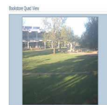
LSUA web cam brings viewers 24/7 view of the Quad