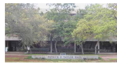
Patrick F. Taylor Hall, home of LSU Engineering