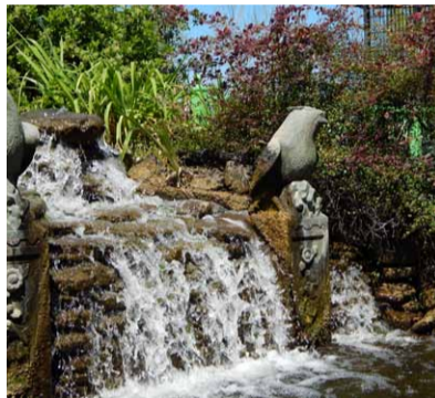
Houmas House Cascade