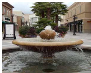
Mall of LA Ball Fountain

Secular insofar as they proclaim no specific ideology yet religious insofar as they applaud the fundamental forms that identify an orderly universe, geometrically preoccupied fountains allow everyone to feel wanted or connected. They provide a clean tablet on which to project the hopes of any creed or community. It is not surprising that the Mall of Louisiana, when it expanded its "Boulevard" in an attempt to recapture market share from Town Center, should also deploy a spherical fountain. Simpler and rather less successful than the Town Center counterpart, this aqueous spheroid pops water into the air and allows it to lap down into an urn-like pool that faintly suggests Louisiana sugar cauldrons. The little water ball near the back door of the Mall of Louisiana seems almost as if it were a backup piece to those who are not quite prepared to handle its more aggressive counterpart, a giant, towering, rectilinear obelisk surmounted by what looks somewhat like a hibachi grill. From this Benihana bin, water spills a prodigious distance into highly regulated, linear streams. Somewhat futurist in tone, the fountain recalls the early