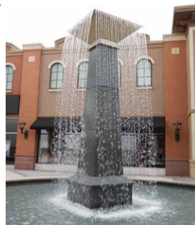
Mall of LA Fountain

A fine example of this kind of formal austerity might be the mysterious moving ball in the Town Center shopping center in which Whole Foods is located. At the intersection between the fashion (frivolity) and food (necessity) segments of this affluence-soaked village of vendors, a large, roseate granite ball rests on an urn from which water inexplicably wells up and spills asymmetrically outward, driving what seems otherwise to be a frictionless sphere. Standing atop a robust ground mosaic of multi-colored stone slabs, the fountain emanates a sense of infinite smoothness that eases the hubbub of what Wordsworth called getting-and-spending, that creates a tiny island of peaceful simplicity in the midst of vanity fair. Although positioned at the vertex of the two great wings of Town Center, the fountain nevertheless seems somehow out-of-the-way and even dwarfed or misplaced amidst the parapet-strewn castle of America's least alternative counter-cultural food source and alongside the blaring windows of dress shops aimed at differing levels of overall prosperity. Town Center, after all, is not in a true town nor is it at the center of anything. Its decentered, anti-semantic fountain both explains the venue in which it resides while it inadvertently symbolizes escape from those impostor centers of attention that keep the cell-phone generation overly engaged.