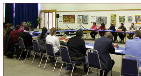
AUC faculty and AUC Woodruff Library staff members attend an Open Access & Scholarly Communication Brown Bag Luncheon sponsored by the AUC Woodruff Library Advisory Council.