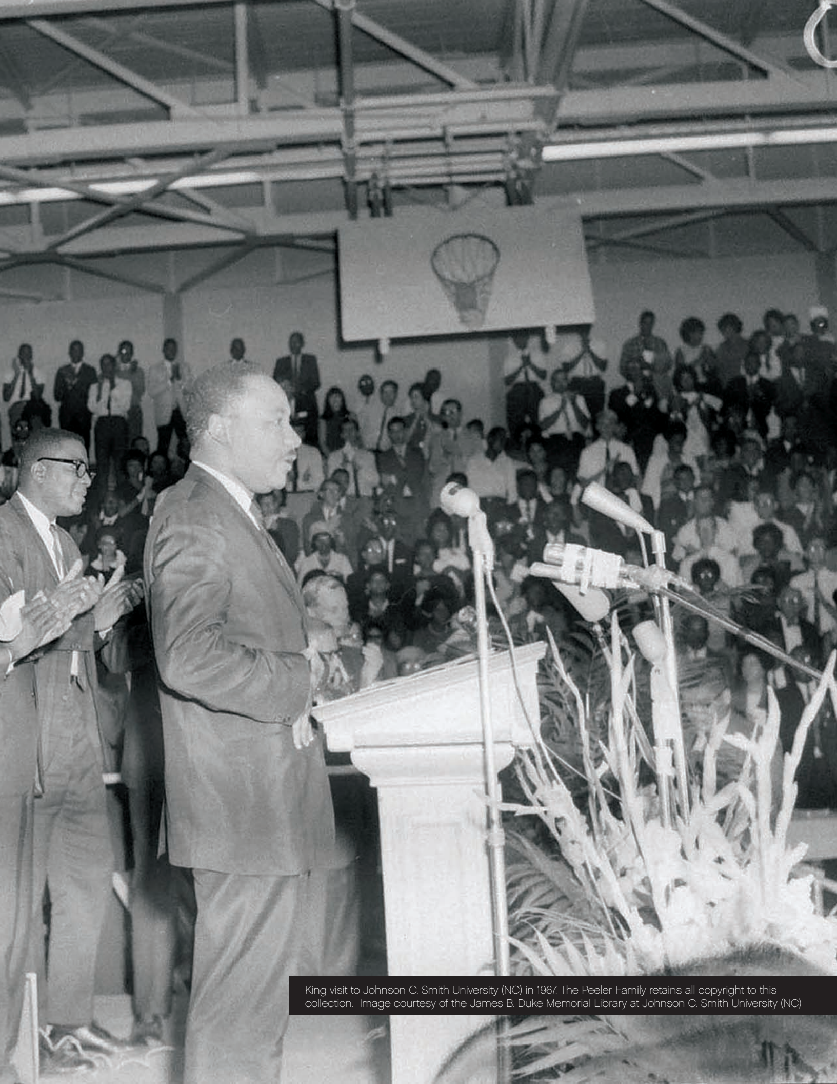
King visit to Johnson C. Smith University (NC) in 1967.