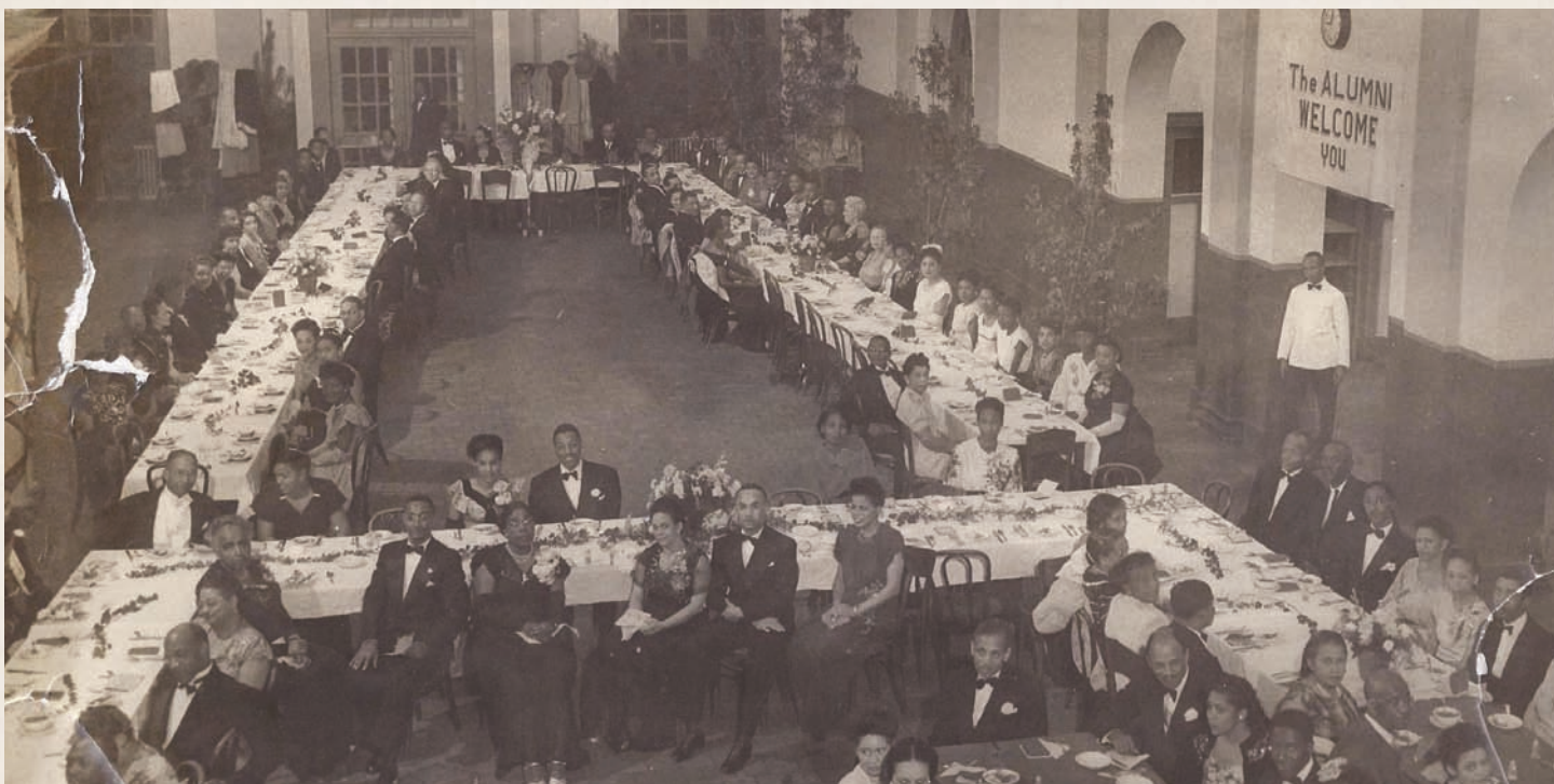
November 7, 1947, Alumni Banquet Dinner Georgia State College Alumni Banquet Dinner held in Adams Hall. The table was arranged in an "A" shape significant for "Alumni"