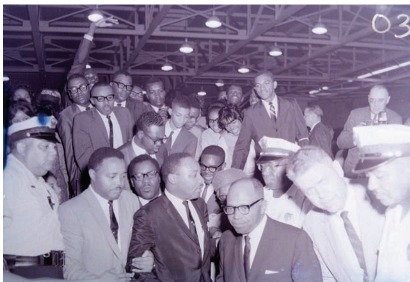
King visit to Johnson C. Smith University (NC) in 1967.